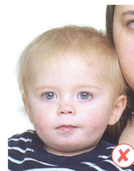
Shows another person