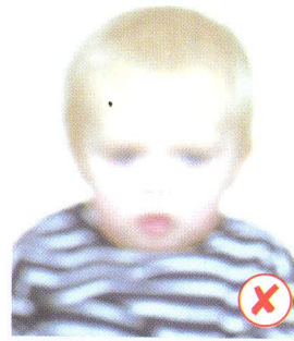
Blurred or too light

Please note photographs become part of the official records of the UKPS and will not be returned. Photographs with a copyright warning attached will not be accepted. For example, school photographs.