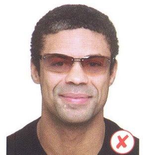
Dark tinted glasses